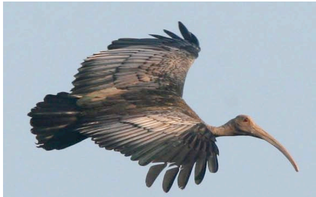
Giant Ibis

The group then moved onto the Ibis Site and the award-winning lodge of Tmatboey in the heart of the largest expanse of dry dipterocarp forest left in S.E Asia. An early morning start was rewarded by the bugling of the Giant Ibis atop a tree with prolonged views.