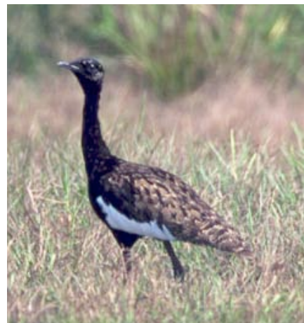
Bengal Florican

On the return to Siem Reap the group drove off the main road into the grassland of the Tonle Sap floodplain for the critically endangered Bengal Florican . This is one of the most threatened habitats in Cambodia with the grassland being ploughed for rice paddy. WCS's efforts to create Integrated Farming and Biodiversity Areas IFBA's paid off on this trip. A male remained visible for extended viewing through the scope. The icing on the cake was a flock of Red Avadavit. Also flushed from the grass were Button Quail, Manchurian reed Warblers and Blue breasted Quail.