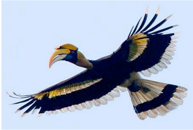
Giant Hornbill

The last destination was the Seima Bio-diversity Conservation Area (SBCA) with mixed evergreen Southern Annamitic forest more usually associated with Vietnam. The flagship Orange necked Partridge was not seen though it had previously been heard, this was more than made up for by a plethora of other species -