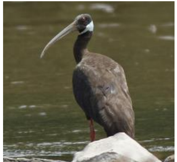
White-shouldered Ibis along the Kratie – Stung Treng Mekong, a key area for this Critically Endangered species

Data from vulture restaurants and censuses for 2013 were finally received (per SM). The most successful restaurants attracted 101 vultures at Veal Krous, Preah Vihear PF in January, including 84 White-rumped Vultures (highest number ever for this site and the second highest for all sites) and 112 vultures at Western Siem Pang on 20 June, holding a record high of 41 Slender-billed Vultures. The synchronized census organized across six restaurants on 10 and 20 June totalled 218 birds, the second lowest since 2006. Yearly census decrease noted since 2010 are worrying and may indicate genuine population decline.