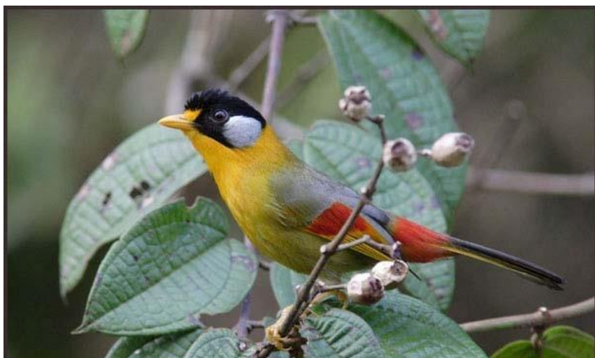
Silver-eared Mesia, a little gem restricted to the Dak Dam corner

Further records of Masked Finfoot were received from Kulen Promtep WS : one female with four chicks were feeding at Daun Tom, Kulen Cheung village on 10 October (RV); one adult female/sub-adult was also noted along the Stung Memay near Antiel village, on 18-19 November (SM). In the Thmat Baeuy area, a nest of Black-necked Stork had an exceptional four chicks near Tropeang Pring on 11 November and one Indian Spotted Eagle was sighted at on 23 November (DN). One White-rumped Pygmy Falcon was seen on the way to Prey-veng reservoir on 12 November and the next day, an Aquila reported as Greater Spotted Eagle (no identification notes provided) en route to Preah Vihear temple is best left unconfirmed (VT).