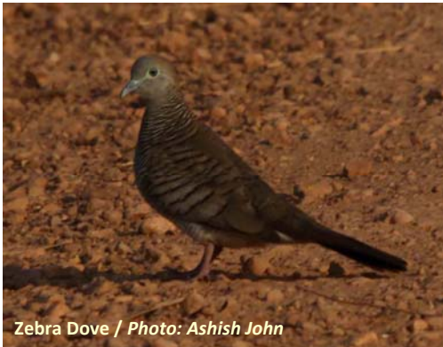
Zebra Dove

Next digest will cover January and February 2011