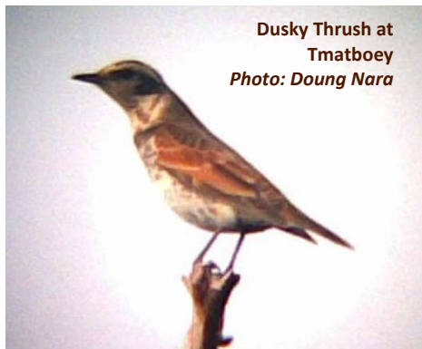
Dusky Thrush at Tmatboey

A Birdlife/PACT survey in five Community Forests of Oddar Meanchey during November recorded 174 species. The presence of Green Peafowl and a single Black-necked Stork in Sorng Rokavorn, plus a single Greater Adjutant in Prey Srong were the most significant findings. White-rumped Falcon and Siamese Fireback were found at three and two sites respectively. A Rufous-bellied Woodpecker , a rarely recorded species, was seen at Sorng Rokavorn. On a distributional note, no less than 77 species were first recorded from this little known province. This included nine firsts for the northwest: Rufous-bellied Eagle , Brown Fish-Owl , Grey-headed Woodpecker , Hooded Pitta , Asian Stubtail (6 th national record), Eastern Crowned Warbler , Lesser Necklaced Laughingthrush , Plain Flowerpecker (10 th record) and Fire-breasted Flowerpecker (nominate subspecies). Rosy Minivet (nominate form) found in Sorng Rokavorn is only the 7 th country record. Last but not least, “ Blyth's-type ” Leaf Warbler and Buff-throated Warbler were first records for Cambodia (all FL and VE).