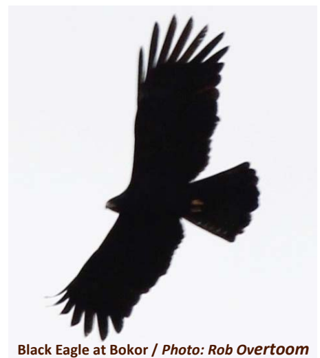
Black Eagle at Bokor

Kampot estuary produced two excellent photographic records on 19