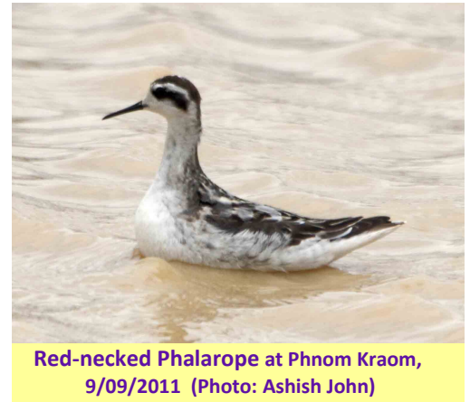
Red-necked Phalarope at Phnom Kraom, 9/09/2011

A single Red-necked Phalarope , a rare passage migrant, was photographed at Phnom Kraom on 9 September, as well as a male Greater Painted-snipe , a species previously exclusively known from Ang Tropeang Thmor in the north-west (AJ).