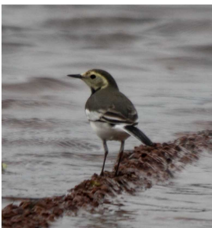
White Wagtail at Tbeng, 22/09/2011

A trip to the north of Phnom Kulen WS in search of Masked Finfoot took place on 19-21 August (FG). During the boat travel along the Stung Sen upstream from Takong, a total of five Green Peafowls were seen roosting at three locations, and a probable Chestnut-winged Cuckoo was flushed. The boat survey along the Stung Memay and surrounding flooded forest yielded an abandoned nest and bubbling call as the only evidences of the elusive finfoot. Three Asian Openbills and a starting colony of Oriental Darters (30+ birds and 15 nests on one tree) were of interest, as was a dark-morph Changeable Hawk-eagle at its nest. Pied Fantail was, surprisingly, a first record for the northern plains, and Zebra Dove was heard or seen at several places.