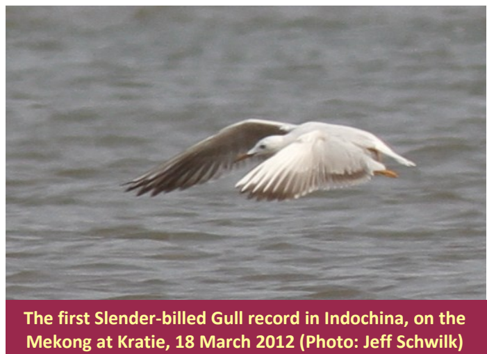
The first Slender-billed Gull record in Indochina, on the Mekong at Kratie, 18 March 2012

A fierce night storm stranded numerous gulls and waders on the sandy bank of Koh Preah island on 18 March, amongst which was a single Slender-billed Gull – the first for Indochina, and perhaps the first time this coastal species has been recorded that far inland. Other interesting migrants on passage there on the same day included a single Red-necked Phalarope , a Black-tailed Godwit and two Eurasian Curlews – the latter two being a first and second record for the northeast respectively (all JS).