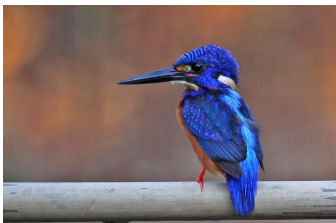
The Blue-eared Kingfisher at ease in a Takeo garden Photo on 24 Feb 2012 (Rob Overtoom)

At Boeng Prek Lepeuw, several Golden-bellied Gerygones heard during 18-24 January (RvZ) add to the recent surge of inland records of this primarily coastal species reported here and in the previous digest. Excellent news there was the sighting of two Black-faced Spoonbills on 23 February, indicating the species might become an annual winter visitor at the site.