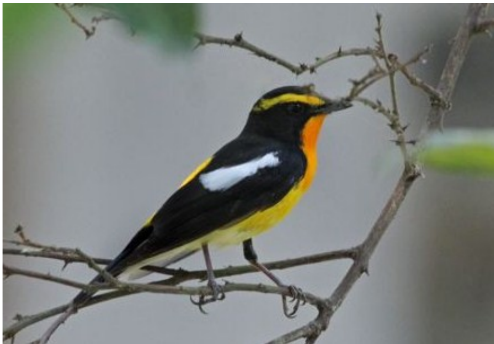
The male Narcissus Flycatcher on passage in a well-watched Takeo garden 29 March 2012

Two adult Germain Peacock-pheasants with one chick were seen and a Malaysian Night-heron was flushed on three occasions along trails around the headquarters of Seima PF during 16-20 March. This is the earliest date for the night-heron, a rare but regular wet season breeding visitor to the area. Also of interest there on same dates was a vocal record of Himalayan Cuckoo , perhaps the first definite record of this recently-split species, otherwise nearly inseparable on plumage from Oriental Cuckoo (all FL, VE).