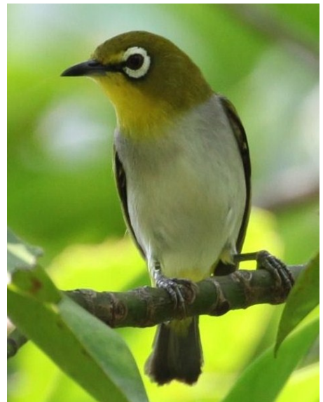
Oriental White-eye Z.p. williamsoni ? Prey Nup mangrove, 11 March 2012

A trip to Koh Tang offshore archipelago on 4-6 March yielded only one frigatebird , one dark morph Pomarine Jaeger and five unidentified jaegers, but scattered flocks of maximum ten Pied Imperial Pigeons (TE) – these two species had not been recorded since 2002 ! The best species found on Kong Rong Senlem during 14-18 March were two calling Spotted Wood-owls and Indochinese Cuckooshrike , both only known at few sites in the southwest, and a maximum count of 38 Oriental Pied Hornbills (HN, FG).