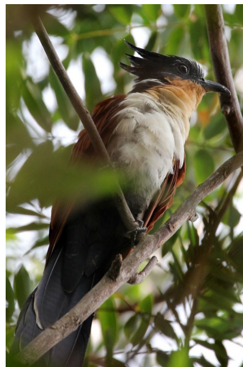
Chestnut-winged Cuckoo in Takeo 15 Feb 2012

At the Borey Cholsar harbor on 19 February, two pairs of Asian Golden Weavers had at least one active nest in a tree, and House Sparrows were found nesting at many sites on village electric wires, antennas, Eucalyptus tree in the area. Not many birds of interest in the wetlands along the canals further east, apart from four Painted Storks in flight, seven Temminck's Stints and three Kentish Plovers (all FG, RO).